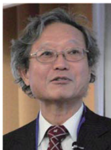
M. Kashiwara (RIMS, Kyoto University)